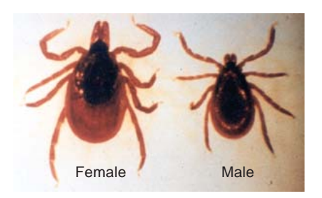
Black legged Tick (enlarged to show detail)

Note: Seventy percent or more of all Lyme disease cases occur from the bite of ticks in the nymph stage.