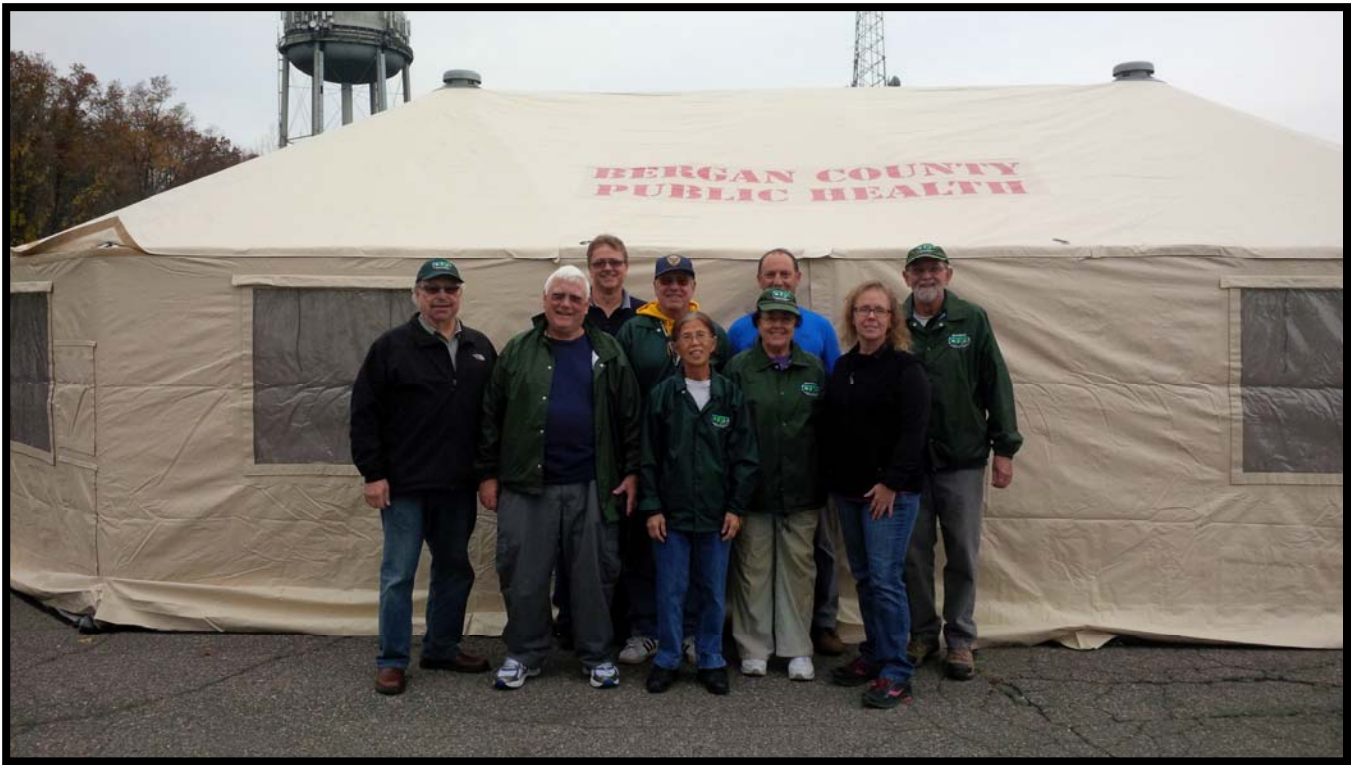
Members of the Mahwah CERT Team take a break from training on the Western Shelter System.

Two municipal CERT teams have stepped up to assist the Bergen County Health Department with the deployment of the Western Shelter System. Representing the southern end of the county is North Arlington CERT and from the northern end of the county Mahwah CERT answered the call. The Western Shelter system is a configuration of three interlocking tents and two trailers. These tents, much the same as military combat operating rooms, are insulated, have full heat and air conditioning and overhead florescent lighting all provided by a stand alone generator.