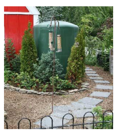
Rainwater captured in a cistern