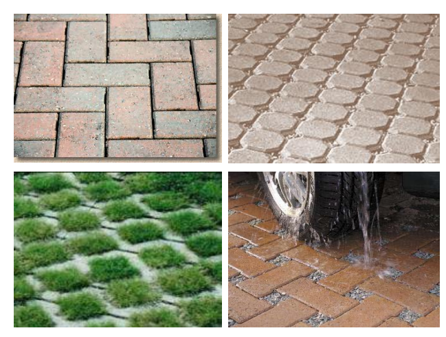
Permeable paving options