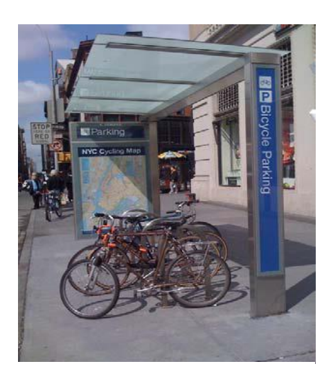
Bicycle parking and shelter