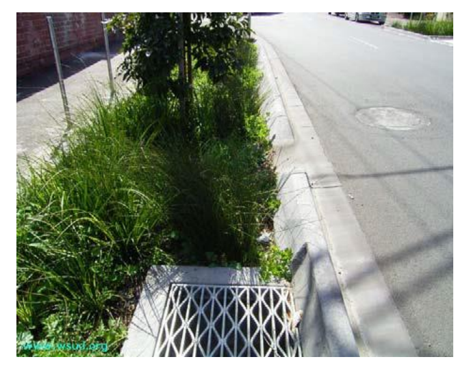
Biorentention swale retro-fit to roadway