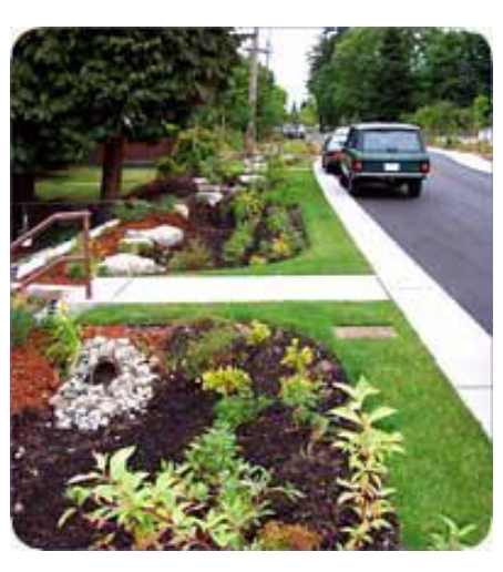
Bioswale along a Residential Street