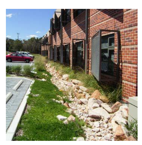
Permeable parking lot and bioretention for commercial buildings