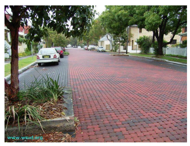
Permeable paver retro-fit for a residential street