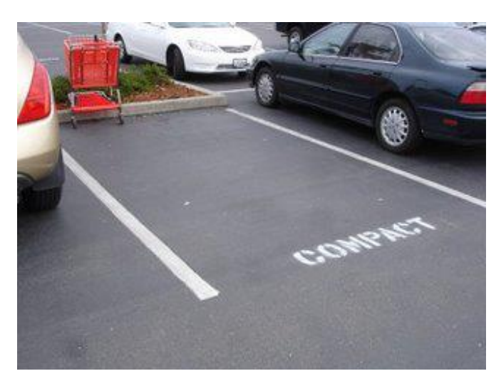
Parking stalls for compact vehicles