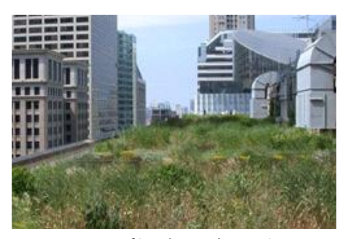
Green Roof in a dense urban setting