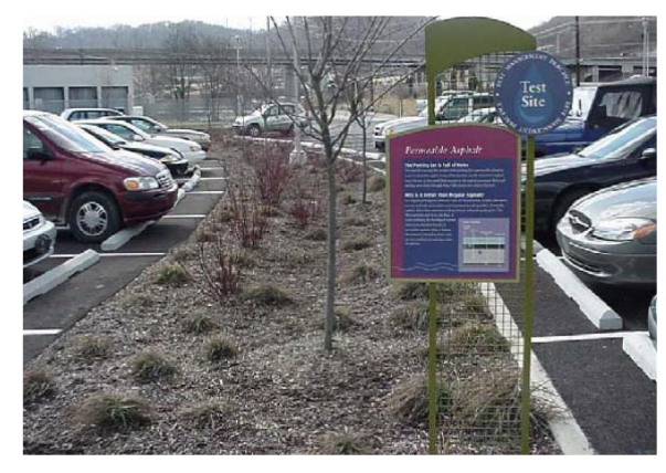
Bioretention swale in a parking area