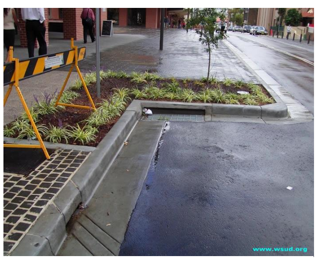
Street tree stormwater treatment retro-fit