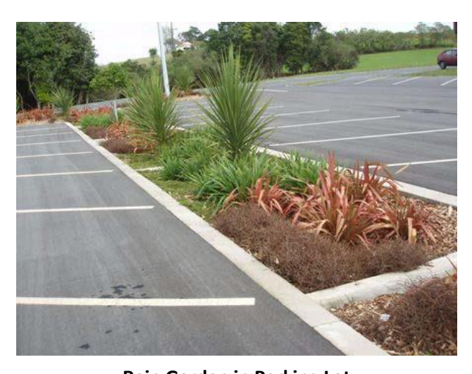
Rain Garden in Parking Lot