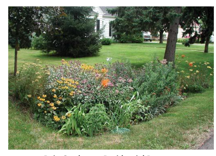
Rain Garden on Residential Property